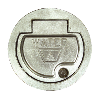
Exterior Finish: Box & Door - Chrome (CH) Only